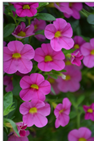
Superbells Pink Calibrachoa flowers

Superbells Pink Calibrachoa is recommended for the following landscape applications;