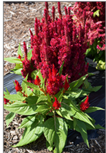
Fresh Look Red Celosia in bloom