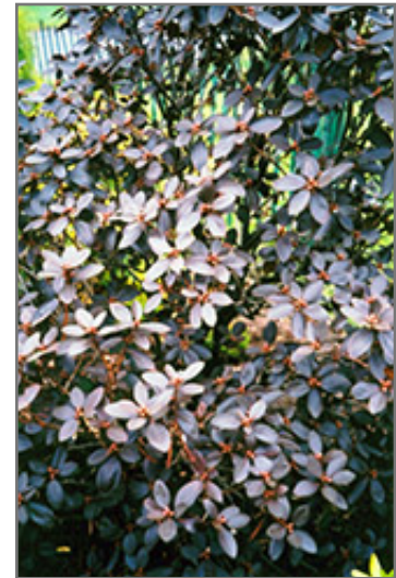
P.J.M. Elite Rhododendron in fall

This shrub does best in full sun to partial shade. You may want to keep it away from hot, dry locations that receive direct afternoon sun or which get reflected sunlight, such as against the south side of a white wall. It requires an evenly moist well-drained soil for optimal growth, but will die in standing water. It is very fussy about its soil conditions and must have rich, acidic soils to ensure success, and is subject to chlorosis (yellowing) of the foliage in alkaline soils. It is somewhat tolerant of urban pollution, and will benefit from being planted in a relatively sheltered location. Consider applying a thick mulch around the root zone in winter to protect it in exposed locations or colder microclimates. This particular variety is an interspecific hybrid.