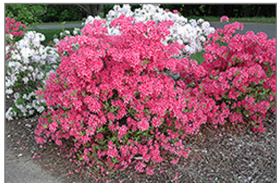
Rosy Lights Azalea in bloom