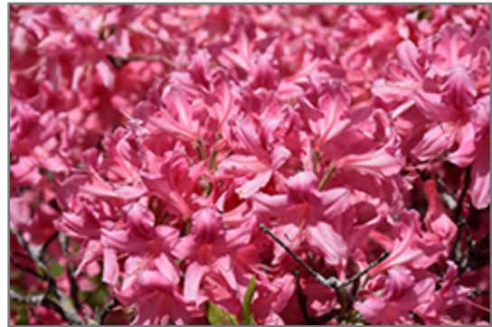
Rosy Lights Azalea flowers

Rosy Lights Azalea is recommended for the following landscape applications;