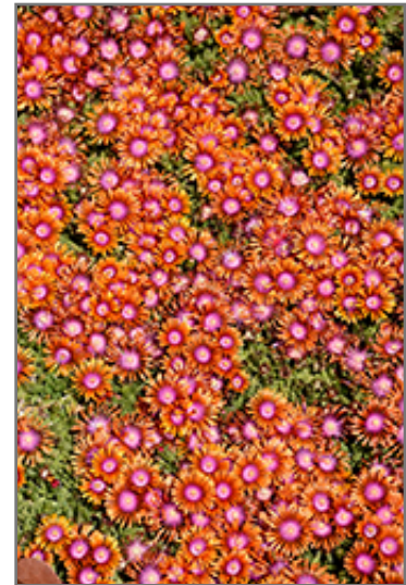
Fire Spinner Ice Plant flowers