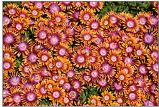
Fire Spinner Ice Plant in bloom

Fire Spinner Ice Plant is recommended for the following landscape applications;