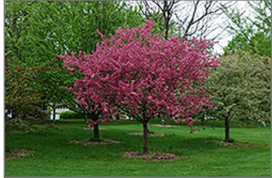
Prairifire Flowering Crab in bloom

This tree will require occasional maintenance and upkeep, and is best pruned in late winter once the threat of extreme cold has passed. It has no significant negative characteristics.