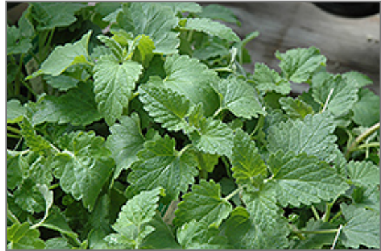
Catnip foliage