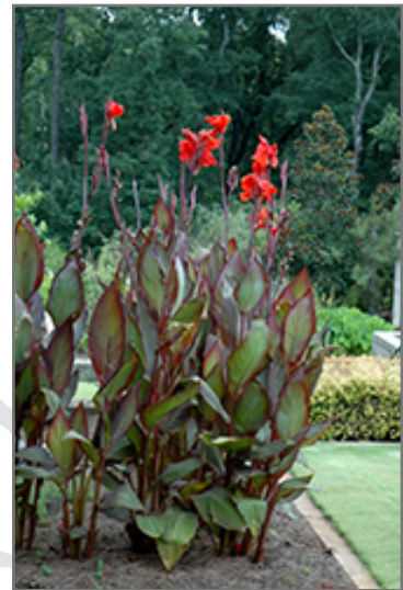
Australia Canna in bloom