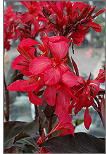
Australia Canna flowers

This plant should only be grown in full sunlight. It requires an evenly moist well-drained soil for optimal growth, but will die in standing water. It is not particular as to soil pH, but grows best in rich soils. It is highly tolerant of urban pollution and will even thrive in inner city environments, and will benefit from being planted in a relatively sheltered location. Consider applying a thick mulch around the root zone in winter to protect it in exposed locations or colder microclimates. This particular variety is an interspecific hybrid. It can be propagated by division; however, as a cultivated variety, be aware that it may be subject to certain restrictions or prohibitions on propagation.