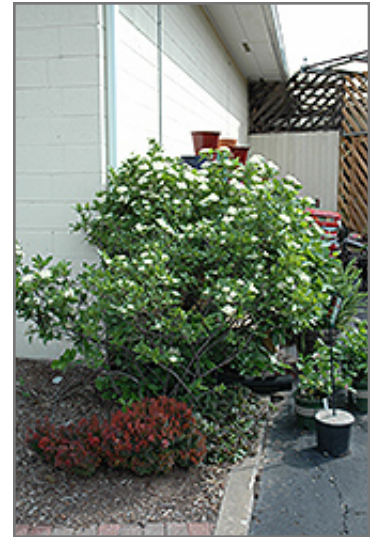
Winterthur Viburnum in bloom