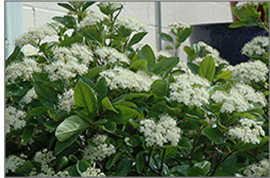
Winterthur Viburnum flowers

Winterthur Viburnum is a dense multi-stemmed deciduous shrub with an upright spreading habit of growth. Its average texture blends into the landscape, but can be balanced by one or two finer or coarser trees or shrubs for an effective composition.