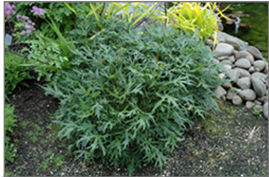
Dragon's Breath Rayflower