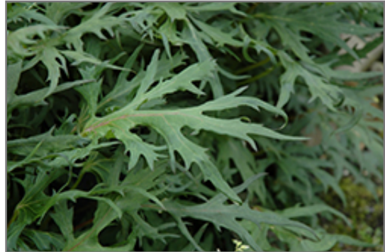
Dragon's Breath Rayflower foliage

Dragon's Breath Rayflower is recommended for the following landscape applications;