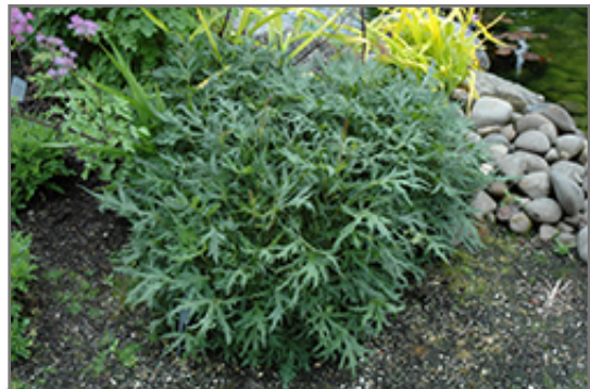
Dragon's Breath Rayflower