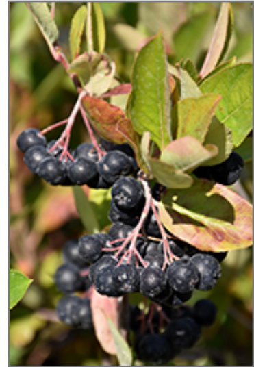
Viking Chokeberry fruit

This shrub should only be grown in full sunlight. It is an amazingly adaptable plant, tolerating both dry conditions and even some standing water. It is not particular as to soil type or pH, and is able to handle environmental salt. It is somewhat tolerant of urban pollution. This particular variety is an interspecific hybrid.