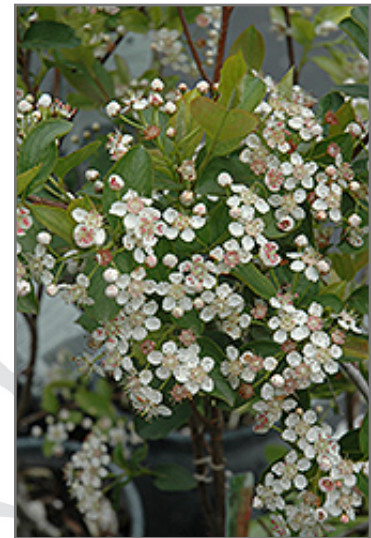
Viking Chokeberry flowers