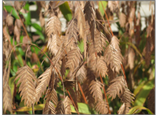
Northern Sea Oats fruit

Northern Sea Oats will grow to be about 4 feet tall at maturity, with a spread of 30 inches. Its foliage tends to remain dense right to the ground, not requiring facer plants in front. It grows at a medium rate, and under ideal conditions can be expected to live for approximately 10 years. As an herbaceous perennial, this plant will usually die back to the crown each winter, and will regrow from the base each spring. Be careful not to disturb the crown in late winter when it may not be readily seen!