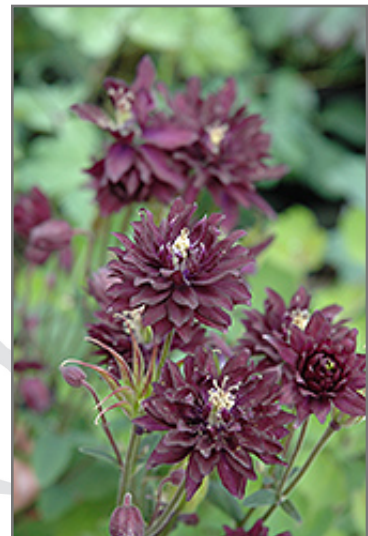
Clementine Dark Purple Columbine flowers