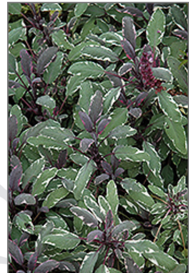
Tricolor Sage foliage