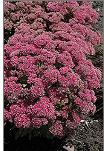
Mr. Goodbud Stonecrop flowers

Mr. Goodbud Stonecrop is recommended for the following landscape applications;