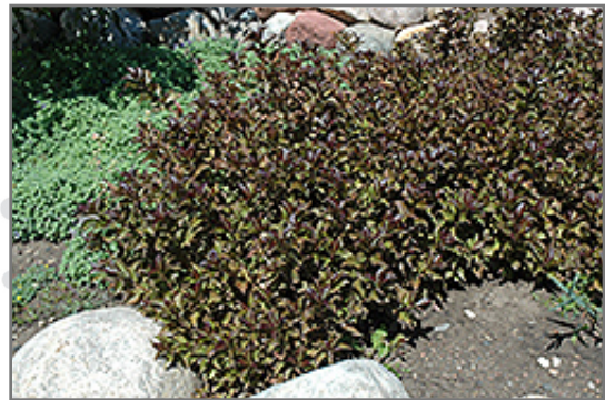
Dark Horse Weigela