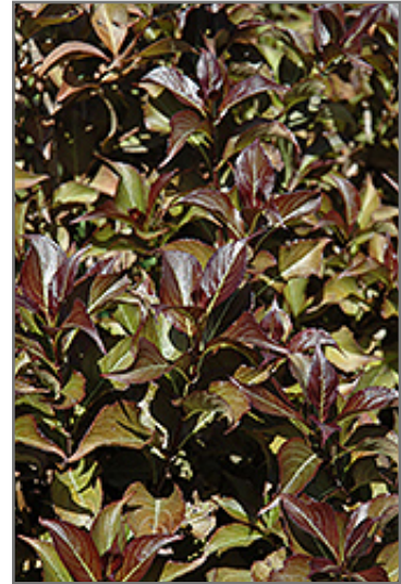
Dark Horse Weigela foliage

Dark Horse Weigela makes a fine choice for the outdoor landscape, but it is also well-suited for use in outdoor pots and containers. Because of its height, it is often used as a 'thriller' in the 'spiller-thriller-filler' container combination; plant it near the center of the pot, surrounded by smaller plants and those that spill over the edges. It is even sizeable enough that it can be grown alone in a suitable container. Note that when grown in a container, it may not perform exactly as indicated on the tag - this is to be expected. Also note that when growing plants in outdoor containers and baskets, they may require more frequent waterings than they would in the yard or garden. Be aware that in our climate, most plants cannot be expected to survive the winter if left in containers outdoors, and this plant is no exception. Contact our experts for more information on how to protect it over the winter months.