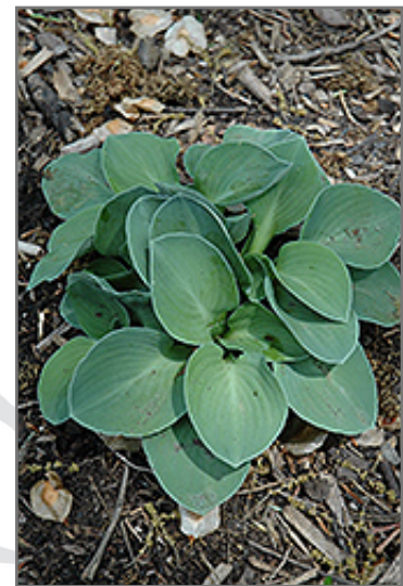
Blue Mouse Ears Hosta