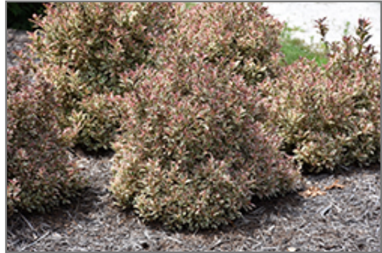
My Monet Weigela

My Monet Weigela makes a fine choice for the outdoor landscape, but it is also well-suited for use in outdoor pots and containers. It is often used as a 'filler' in the 'spiller-thriller-filler' container combination, providing a mass of flowers and foliage against which the thriller plants stand out. Note that when grown in a container, it may not perform exactly as indicated on the tag - this is to be expected. Also note that when growing plants in outdoor containers and baskets, they may require more frequent waterings than they would in the yard or garden. Be aware that in our climate, most plants cannot be expected to survive the winter if left in containers outdoors, and this plant is no exception. Contact our experts for more information on how to protect it over the winter months.