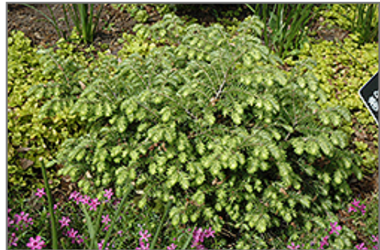
Moon Frost Hemlock

Moon Frost Hemlock is recommended for the following landscape applications;