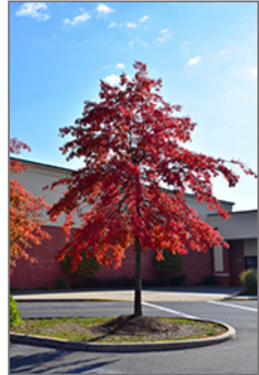
Pin Oak in fall

Pin Oak is recommended for the following landscape applications;