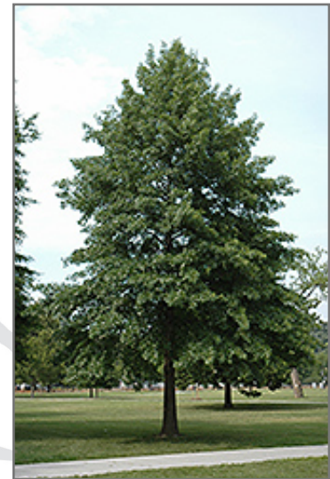
Pin Oak