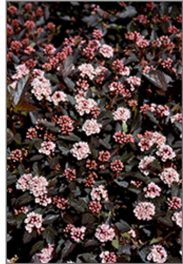
Little Joker Ninebark flowers