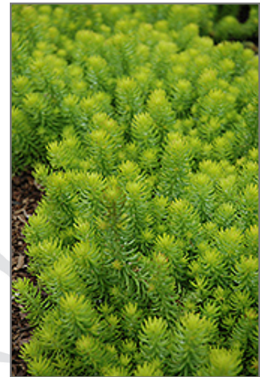
Angelina Stonecrop foliage