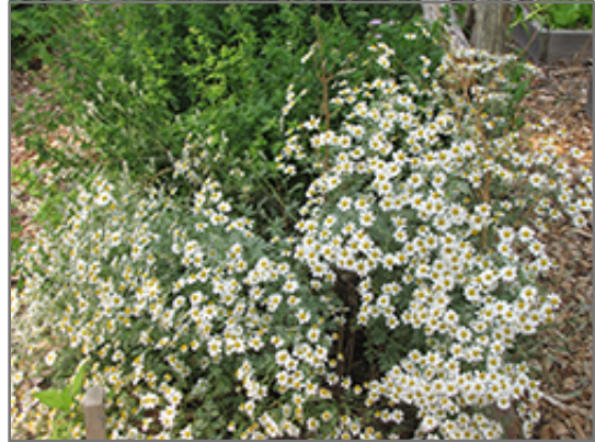
German Chamomile

German Chamomile will grow to be about 24 inches tall at maturity, with a spread of 18 inches. It grows at a fast rate, and under ideal conditions can be expected to live for approximately 5 years. As an herbaceous perennial, this plant will usually die back to the crown each winter, and will regrow from the base each spring. Be careful not to disturb the crown in late winter when it may not be readily seen!