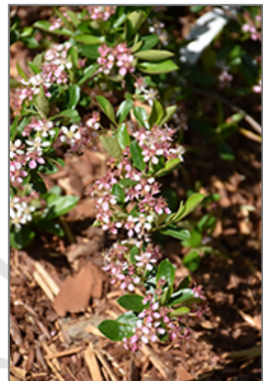
Ground Hug Aronia flowers