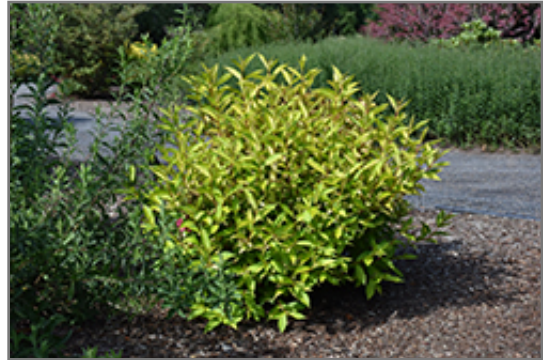
Golden Jackpot Weigela

Golden Jackpot Weigela makes a fine choice for the outdoor landscape, but it is also well-suited for use in outdoor pots and containers. Because of its height, it is often used as a 'thriller' in the 'spiller-thriller-filler' container combination; plant it near the center of the pot, surrounded by smaller plants and those that spill over the edges. It is even sizeable enough that it can be grown alone in a suitable container. Note that when grown in a container, it may not perform exactly as indicated on the tag - this is to be expected. Also note that when growing plants in outdoor containers and baskets, they may require more frequent waterings than they would in the yard or garden. Be aware that in our climate, most plants cannot be expected to survive the winter if left in containers outdoors, and this plant is no exception. Contact our experts for more information on how to protect it over the winter months.