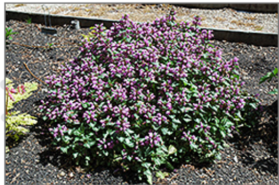
Beacon Silver Spotted Dead Nettle in bloom