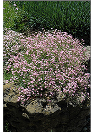
Pink Creeping Baby's Breath in bloom