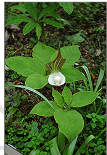
Japanese Jack-In-The-Pulpit in bloom