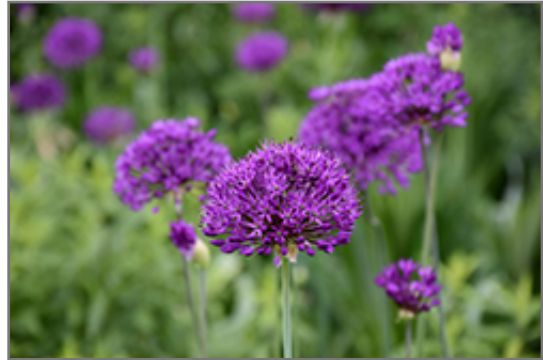
Purple Sensation Ornamental Onion flowers

Purple Sensation Ornamental Onion is an open herbaceous perennial with tall flower stalks held atop a low mound of foliage. Its relatively coarse texture can be used to stand it apart from other garden plants with finer foliage.