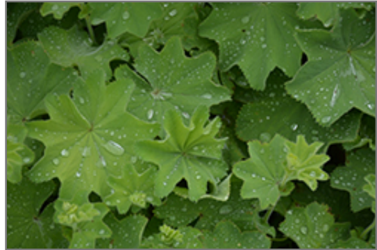
Lady's Mantle foliage

Lady's Mantle will grow to be about 18 inches tall at maturity, with a spread of 18 inches. Its foliage tends to remain dense right to the ground, not requiring facer plants in front. It grows at a medium rate, and under ideal conditions can be expected to live for approximately 10 years. As an herbaceous perennial, this plant will usually die back to the crown each winter, and will regrow from the base each spring. Be careful not to disturb the crown in late winter when it may not be readily seen!