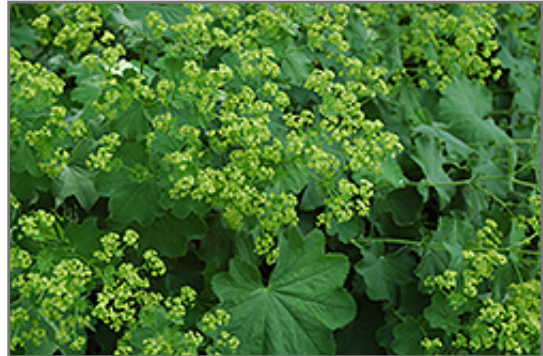
Lady's Mantle flowers

Lady's Mantle is recommended for the following landscape applications;