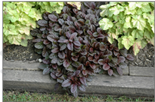
Mahogany Bugleweed