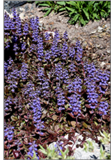
Mahogany Bugleweed flowers

Mahogany Bugleweed is a dense herbaceous evergreen perennial with a ground-hugging habit of growth. Its relatively fine texture sets it apart from other garden plants with less refined foliage.