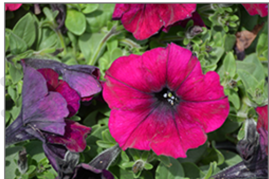
Easy Wave Burgundy Velour Petunia flowers