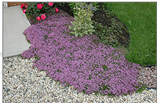
Red Creeping Thyme in bloom