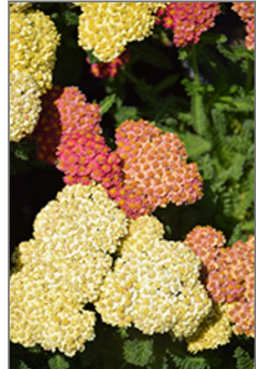
Desert Eve Terracotta Yarrow flowers