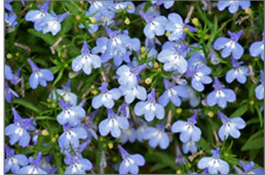
Techno Upright Light Blue Lobelia flowers

Techno Upright Light Blue Lobelia is recommended for the following landscape applications;