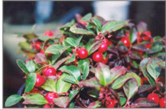
Creeping Wintergreen fruit