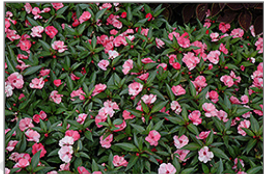
SunPatiens Spreading Pink Flash New Guinea Impatiens in bloom