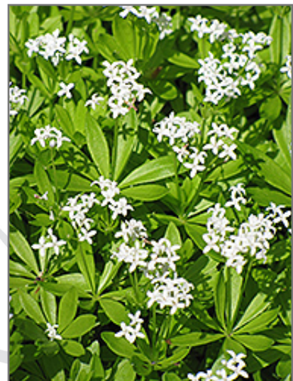
Sweet Woodruff flowers