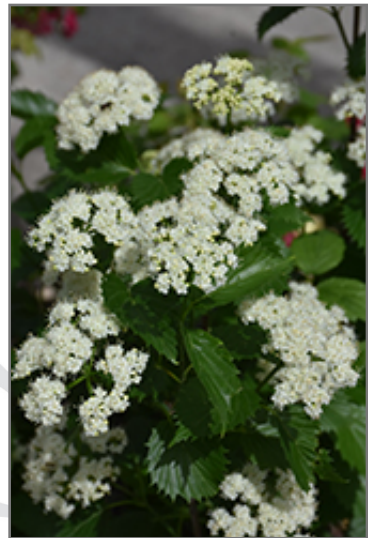
Blue Muffin Viburnum flowers