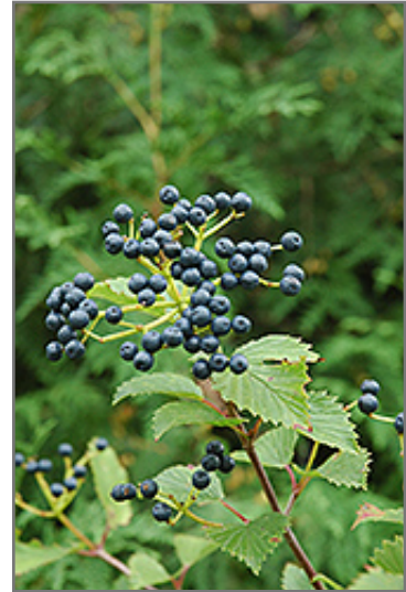
Blue Muffin Viburnum fruit

Blue Muffin Viburnum is recommended for the following landscape applications;