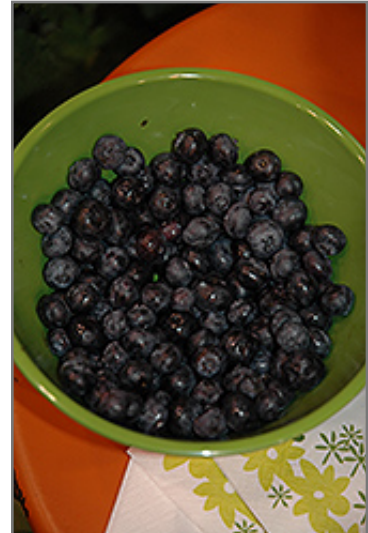
Peach Sorbet Blueberry fruit

This shrub is quite ornamental as well as edible, and is as much at home in a landscape or flower garden as it is in a designated edibles garden. It does best in full sun to partial shade. It does best in average to evenly moist conditions, but will not tolerate standing water. It is very fussy about its soil conditions and must have sandy, acidic soils to ensure success, and is subject to chlorosis (yellowing) of the foliage in alkaline soils. It is quite intolerant of urban pollution, therefore inner city or urban streetside plantings are best avoided, and will benefit from being planted in a relatively sheltered location. Consider applying a thick mulch around the root zone in winter to protect it in exposed locations or colder microclimates. This particular variety is an interspecific hybrid.