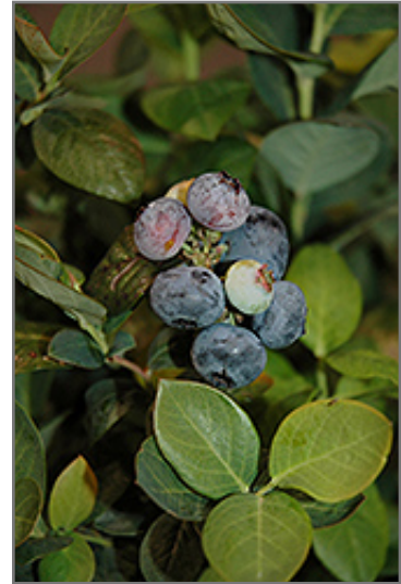
Peach Sorbet Blueberry fruit

Peach Sorbet Blueberry features dainty clusters of white bell-shaped flowers hanging below the branches in mid spring. It has green evergreen foliage. The glossy oval leaves turn an outstanding deep purple in the fall, which persists throughout the winter. It features an abundance of magnificent blue berries from early to mid summer.