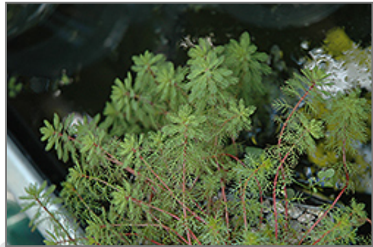
Red Stemmed Parrot Feather foliage