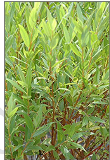
Flame Willow foliage