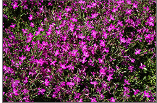
Techno Violet Lobelia flowers

Techno Violet Lobelia will grow to be about 8 inches tall at maturity, with a spread of 12 inches. When grown in masses or used as a bedding plant, individual plants should be spaced approximately 10 inches apart. Its foliage tends to remain low and dense right to the ground. Although it's not a true annual, this fast-growing plant can be expected to behave as an annual in our climate if left outdoors over the winter, usually needing replacement the following year. As such, gardeners should take into consideration that it will perform differently than it would in its native habitat.