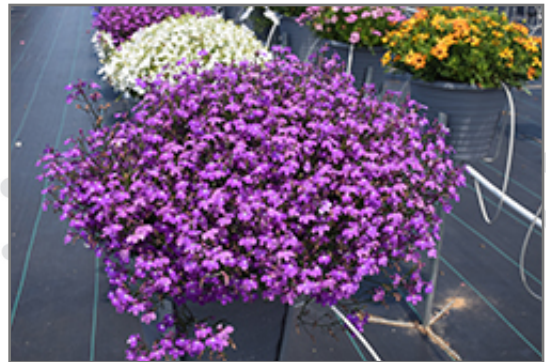
Techno Violet Lobelia in bloom