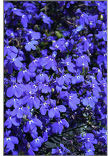
Techno Blue Lobelia flowers

Techno Blue Lobelia is recommended for the following landscape applications;