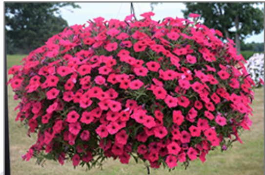
Supertunia Vista Fuchsia Petunia in bloom