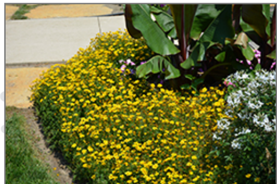
Goldilocks Rocks Bidens in bloom