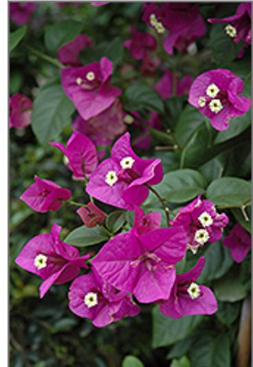
Purple Queen Bougainvillea flowers