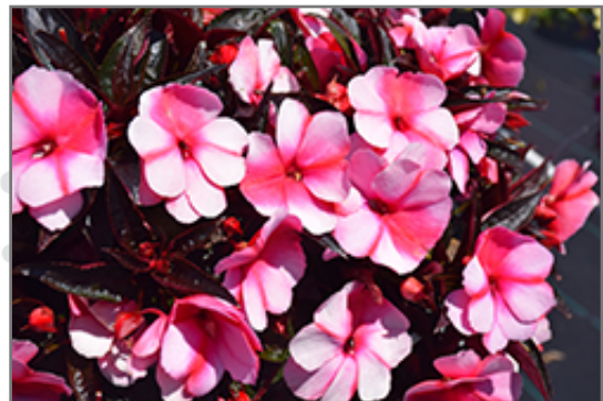
Super Sonic Sweet Cherry New Guinea Impatiens flowers