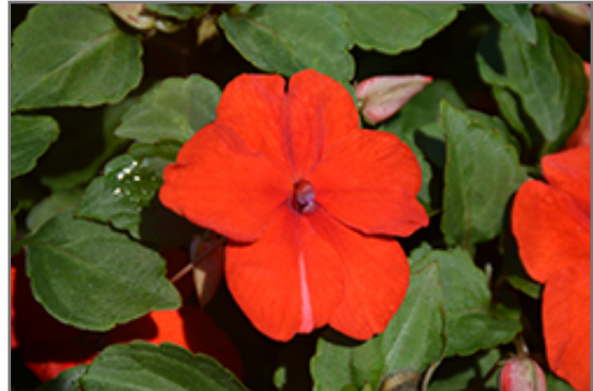
Super Elfin XP Scarlet Impatiens flowers

Super Elfin XP Scarlet Impatiens is recommended for the following landscape applications;