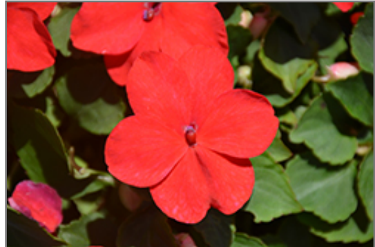
Super Elfin XP Melon Impatiens in bloom

Super Elfin XP Melon Impatiens is recommended for the following landscape applications;