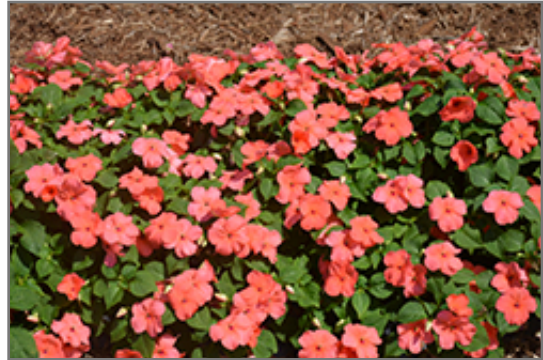
Super Elfin XP Melon Impatiens flowers

Super Elfin XP Melon Impatiens will grow to be about 10 inches tall at maturity, with a spread of 12 inches. When grown in masses or used as a bedding plant, individual plants should be spaced approximately 10 inches apart. Its foliage tends to remain low and dense right to the ground. This fast-growing annual will normally live for one full growing season, needing replacement the following year.